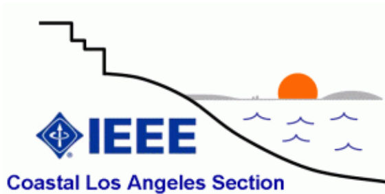
Coastal LA Section